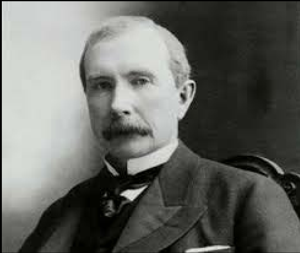
John D. Rockefeller