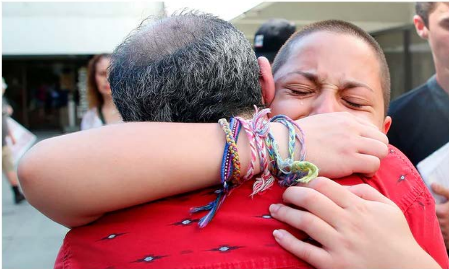
▲ Marjory Stoneman Douglas student Emma González hugs her father after speaking at a rally.

Authors say research into assault weapons ban, universal background checks, and other proposals helps fill gaps in 'a fact-free environment'