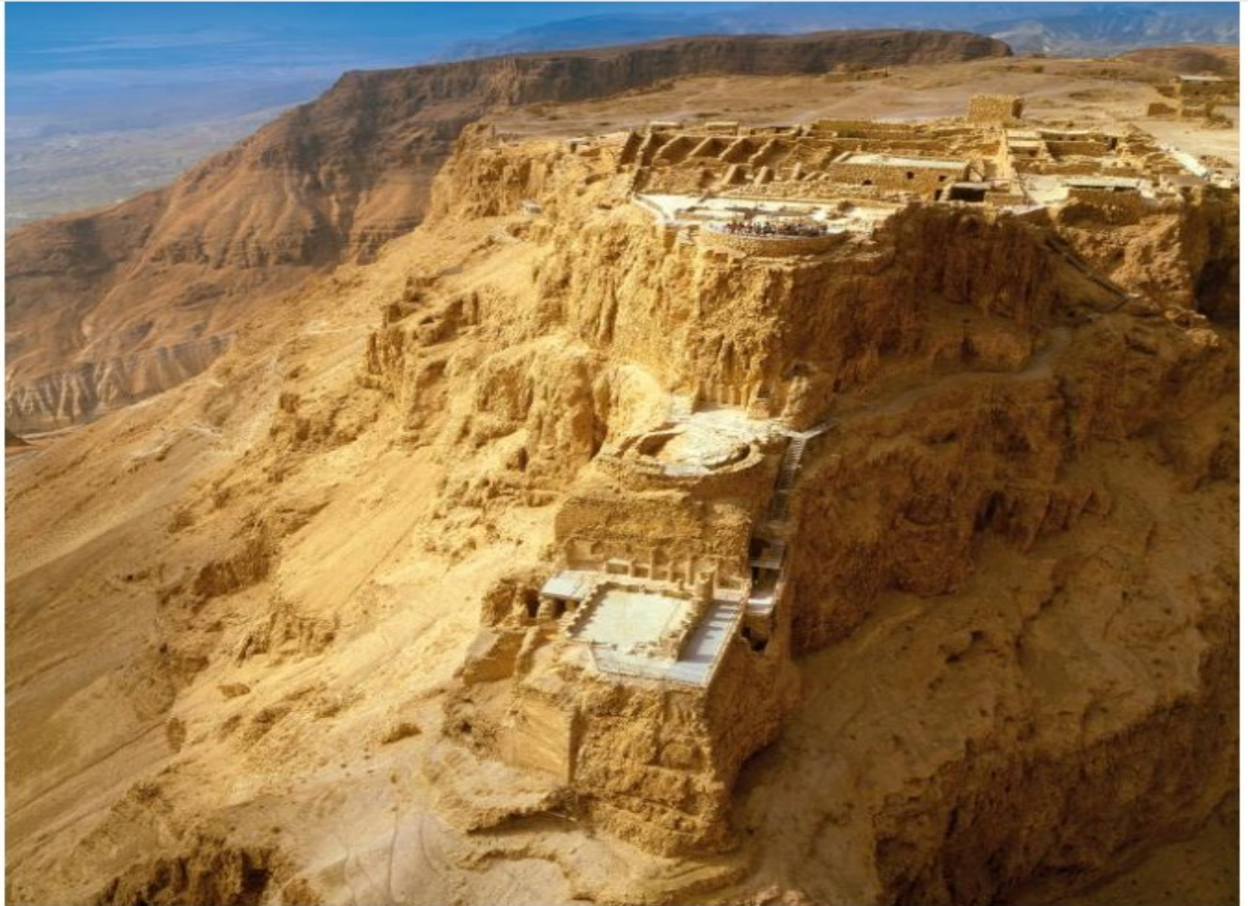
King Herod's legacy as an innovative builder was established by structures such as the imposing fortress of Masada nestled in the Judaeen cliffs.